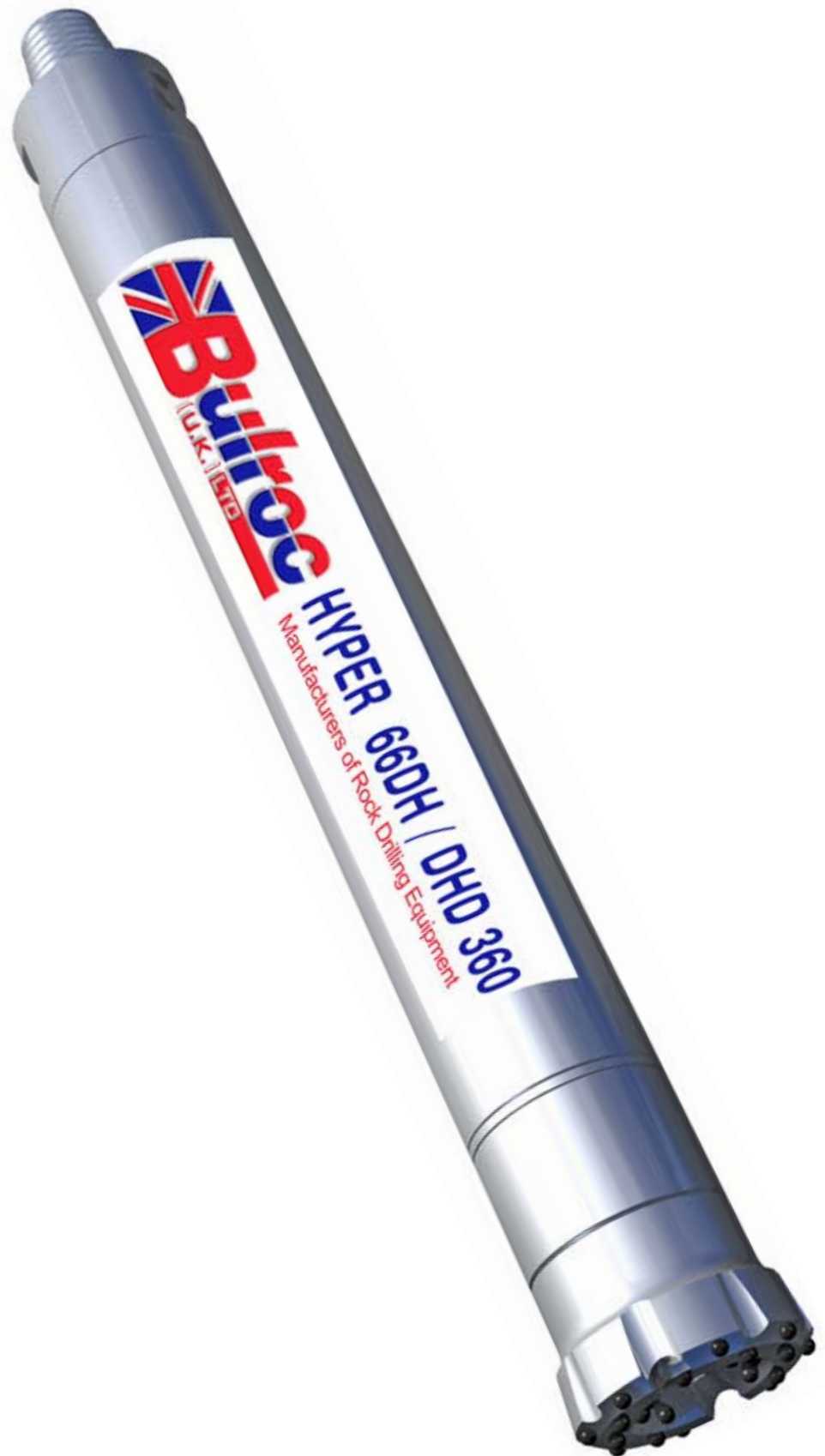
Hyper 66DH / DHD 360 Hammer