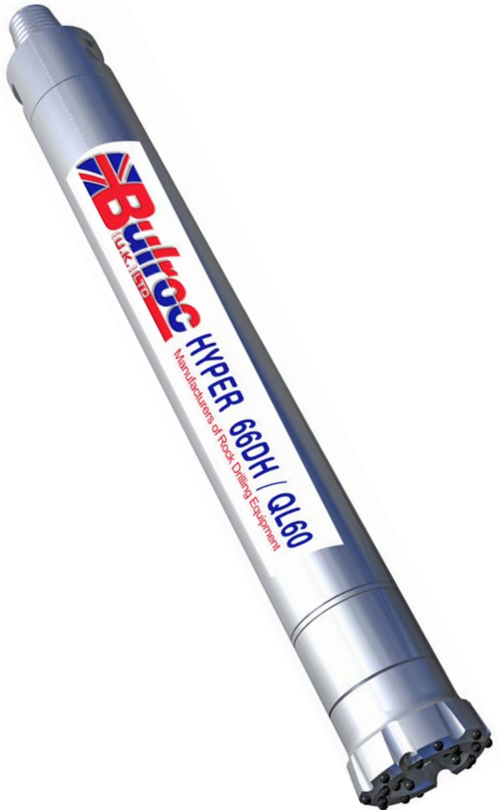
Hyper 66DH / QL60 Hammer