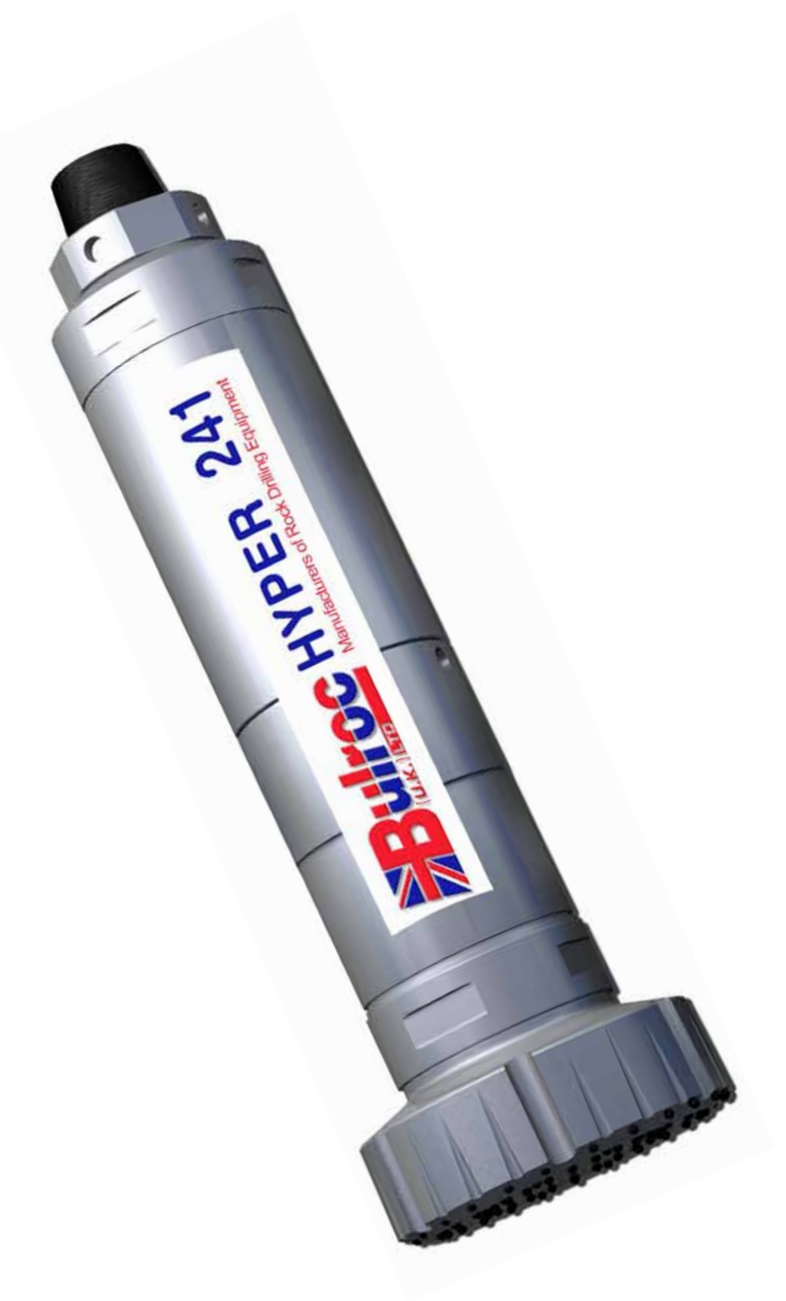
Hyper 241 D.T.H Hammer